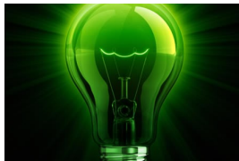
Illuminate your employment future with an internship class

Local Tampa Bay businesses and organizations sponsoring students direct and counsel the intern in an on-the-job context for 10-12 hours per week for each 15-week semester.